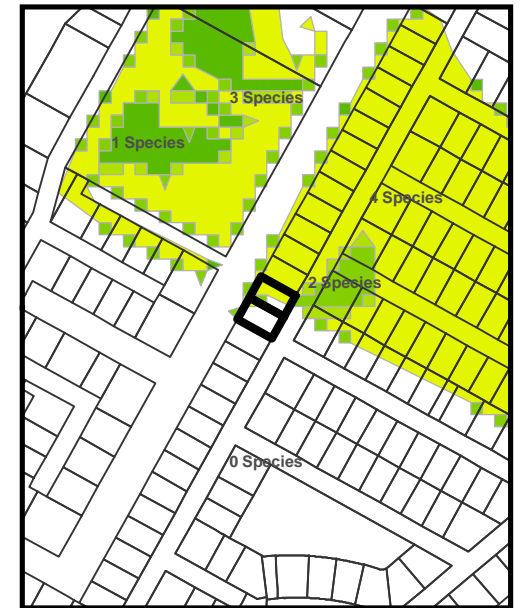
Number of Protected Species